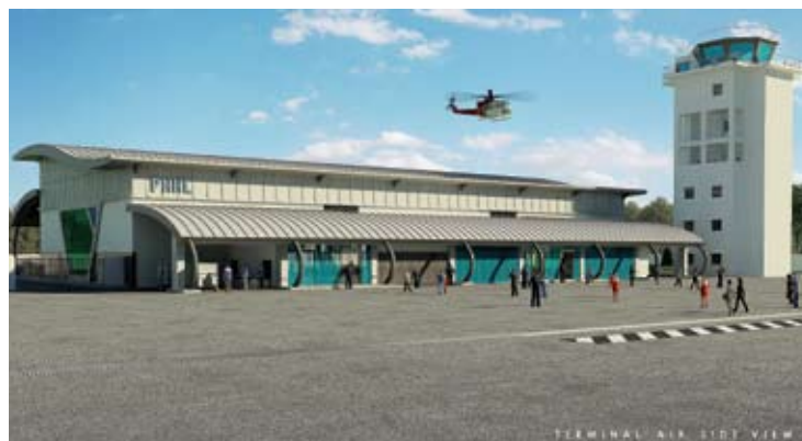
Nations First Heliport at Rohini, Delhi

Most of these unused airports/ airstrips have runways of 1000 mt to 1100 mt length which are reasonably suitable for operation of small 18-20 seater aircrafts. The New Civil Aviation Policy of Ministry of Civil Aviations has put lots of emphasis to improve regional air-connectivity in Tier-II and Tier-III cities. It is a huge market. Pawan Hans is looking at routes/ places where it can be develop as sustainable and